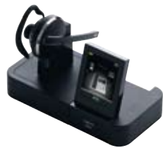
L M N PRO 9400 Serie