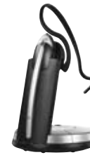
A B C GN9300 Serie