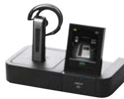
O P GO 6400 Serie