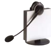
D E F G GN9120 Serie