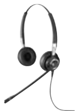
K I M N O BIZ 2400 Serie