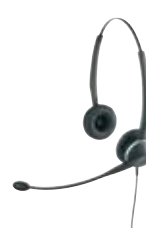
C D GN2100 Serie